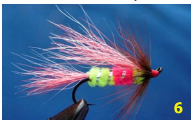
The Finished Fly

Finish off with a good solid red thread head. Whip finish and apply head cement.