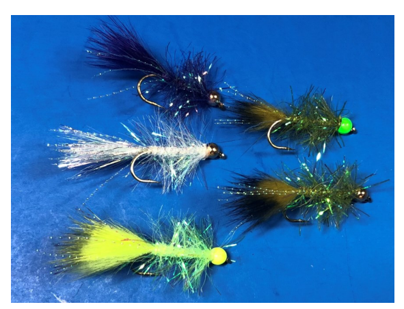
7ight Lines & Good Luck!