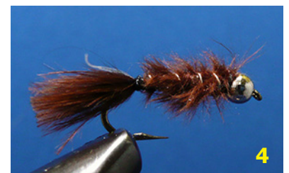
Skagit River Nymph