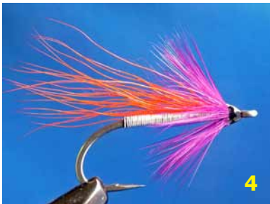
The Purple Flash - Summer Version