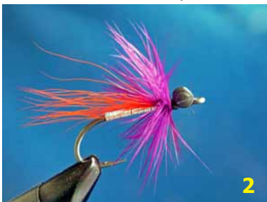
The Purple Flash - Winter Version