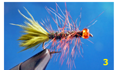
The Finished Fly