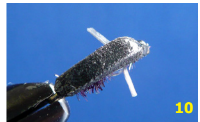
The Finished Fly