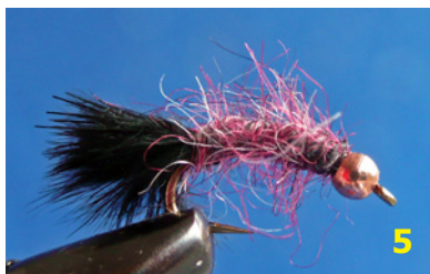
Bead Head Micro Leech