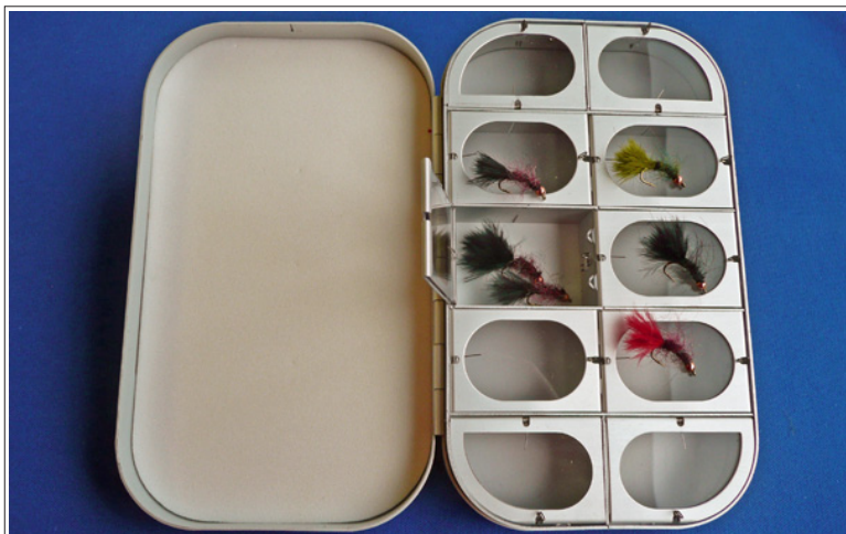
Bead Head Micro Leeches in various colours.