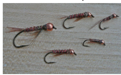
Mayfly Chironomid in various sizes