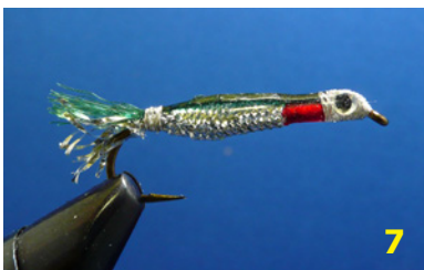
The Finished Fly