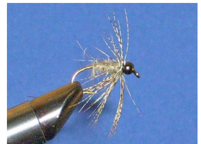
Bead Headed Hare's Ear Nymph