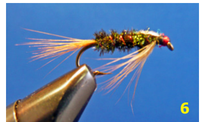
Half Arsed Back

TYER'S NOTE: To show that the fly is weighted, add a few wraps of red thread (or any other contrasting colour).