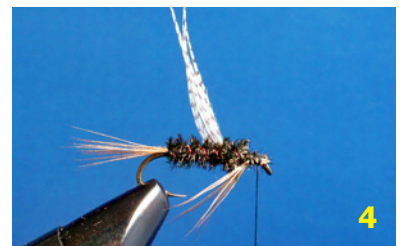
The Finished Fly