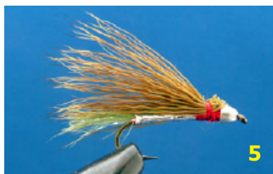
The Finished Fly