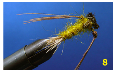
The Finished Fly