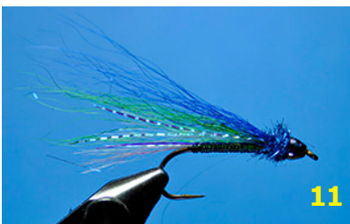
The Finished Fly