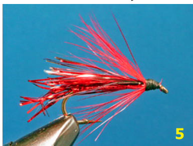
The "Red Shiner"

Wrap the hackle. Tie off and clip the excess. Form a thread head. Whip finish and add a drop of head cement.