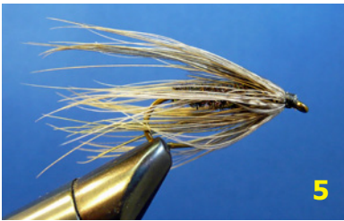
Peacock Carey Special