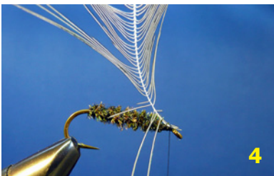
The Finished Fly