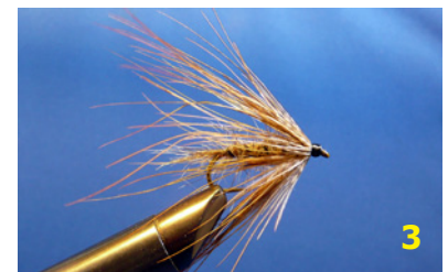
The Finished Fly