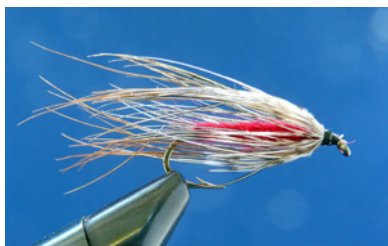
Red Carey Special