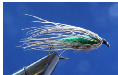
Green Carey Special