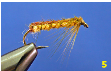
Pale Yellow Body, Olive Hackle