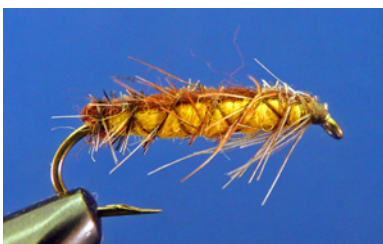
Canary Yellow Body, Brown Hackle

Trim the hackle on the top and bottom and then the sides. Wider at the eye of the hook tapering to the hook bend. Note: For the "Interior Version" when clipping the hackle leave a small beard below the eye.